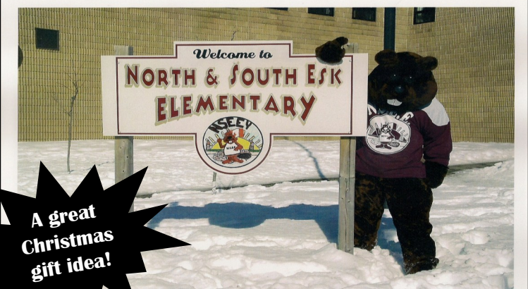
North and South Esk Elementary School